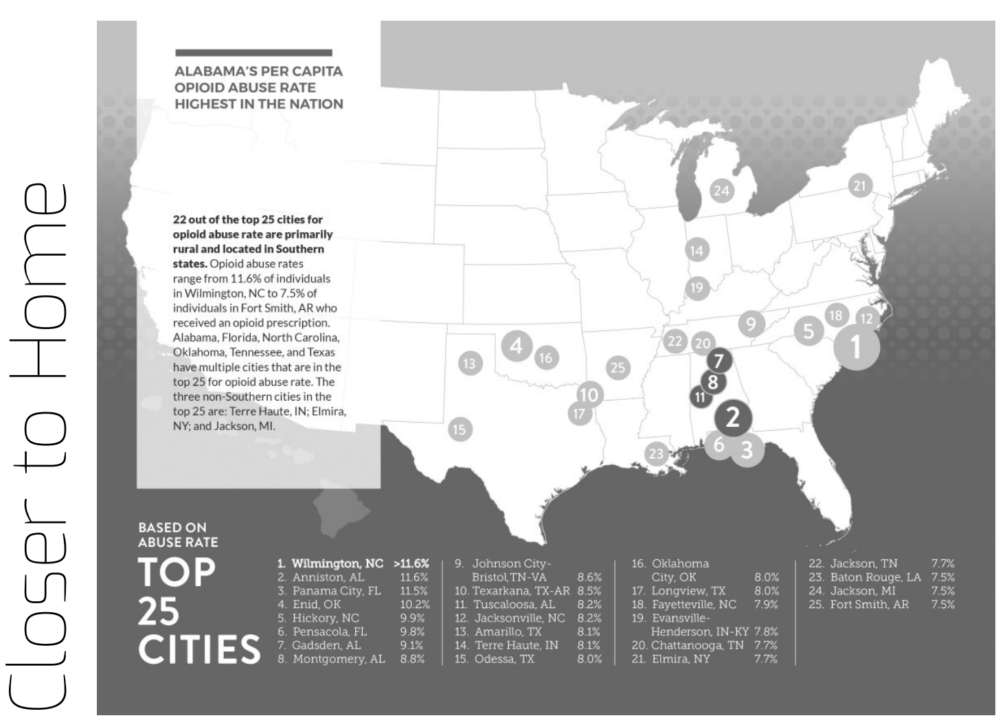
* "The Opioid Crisis in America's Workforce", Castlight Health, 2016

Alabama has the highest per capita level of prescription opioid use in the nation. Our doctors wrote 5.8 million prescriptions for pain pills in 2015, according to the C.D.C. That amounts to 1.2 prescriptions per person (the national average is 0.71). The State of Alabama and all of its Counties and Cities, and especially those with Colleges and Universities are experiencing the full impact. Early data from 2017 suggests that drug overdose deaths will continue to rise this year. It's the only aspect of American health that is getting significantly worse, according to the Director of the C.D.C. Over two million Americans are estimated to be dependent on opioids, and an additional 95 million used prescription painkillers in the past year — more than used tobacco.